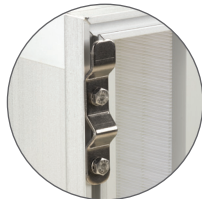
Gel Seal Frame Extractor Clips

AstroCel® III filters are designed for installation into high integrity filter holding frames, side access housings, and bag in/bag out systems, including one piece urethane. Multiple gasket seal filters are available, as well as gel seal filters for frames and systems designed with knife-edge seal framing. Extractor clips are offered for side access systems requiring gel seal frames.