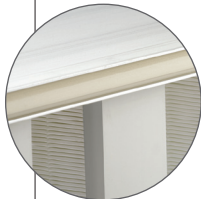
Gel Seal Frame